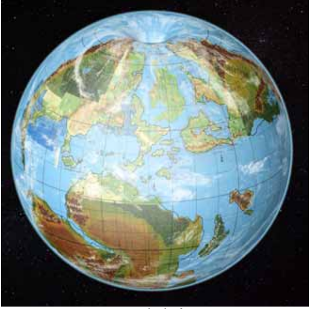
map by thorf

6 According the Gold box Immortal Set; Mystara, aka Urt, has 5000 power points available to be used. In its active phase, a megalith can use all forms of Power attacks, and can create any magical effect within its Sphere by standard procedures. The range of such effects is measured from the creature's outer edge, not the core. Of generally good intentions,