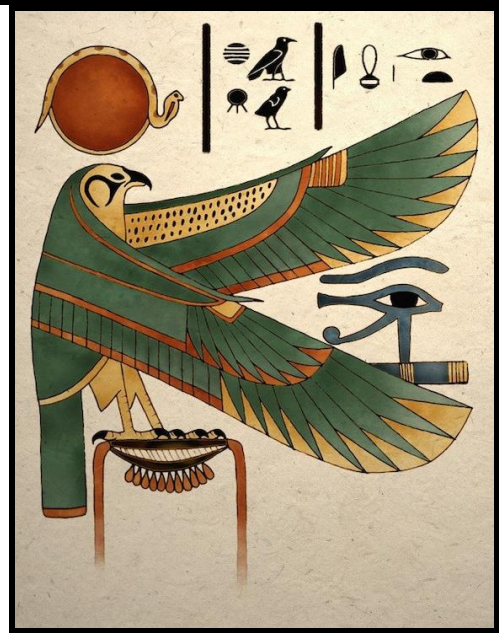
Description of Horus in Nithian