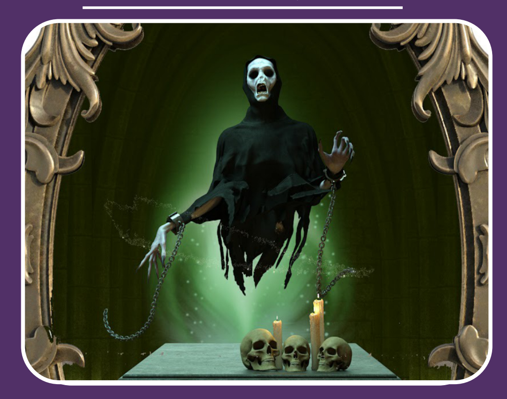
Vampines and the Undead

In this new issue of THRESHOLD magazine we meet the terrifying dark powers of Mystara's undead.